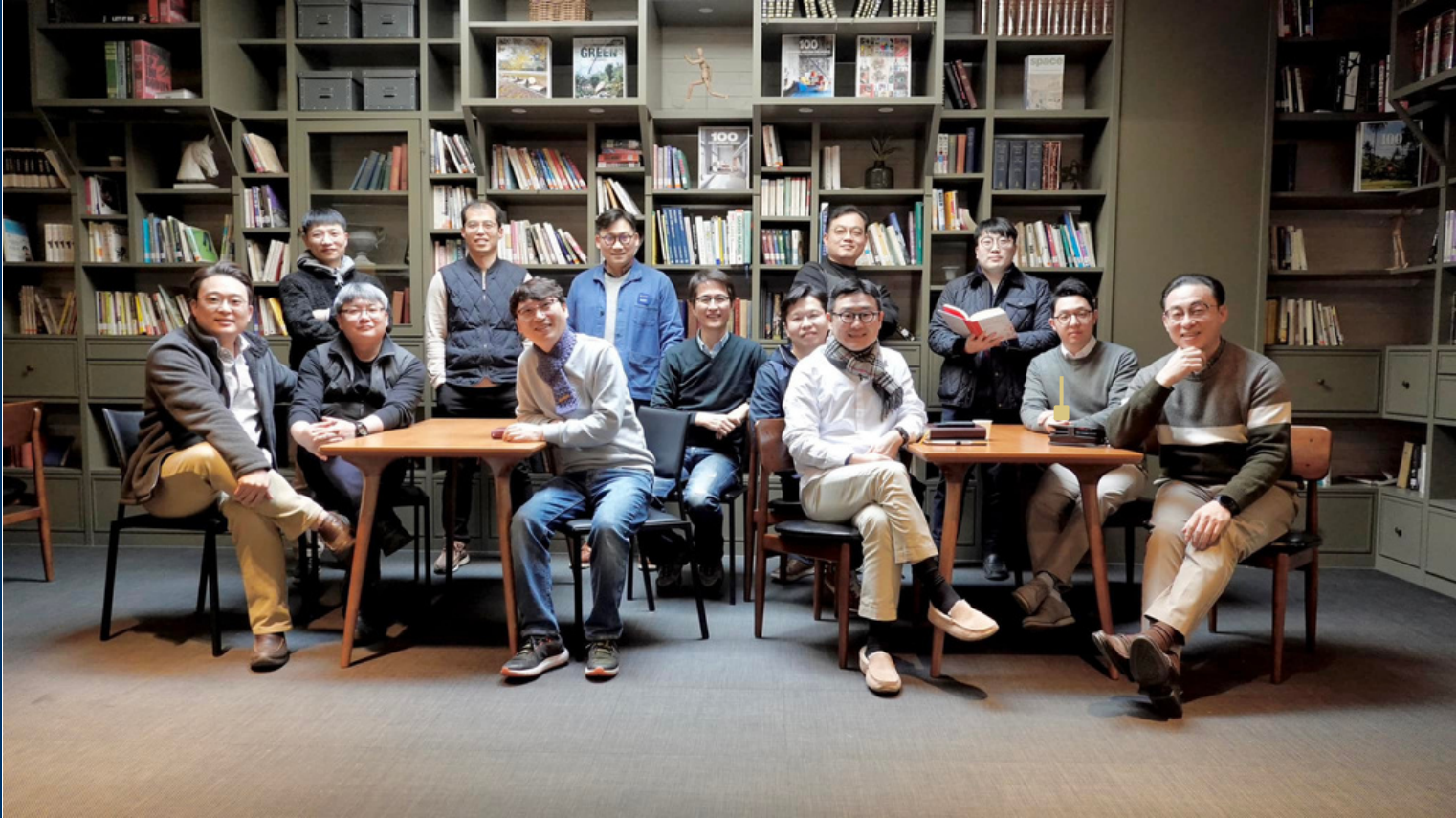
Pastors in Cohort B, GCI Korea