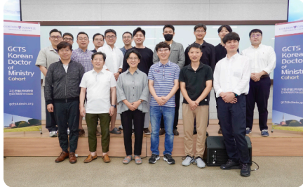
First Doctor of Ministry Korea cohort in Seoul, Korea

The Gordon-Conwell Institute (GCI) - Korea is excited to report that 30 pastors have completed their capstone projects in the GCI Ministry Competency Program. Seventeen of these pastors are continuing their studies through the Gordon-Conwell DMin program, which began on September 13, 2023 in Seoul, Korea. The second cohort for GCI Ministry Competency Program has also embarked a new journey on September 11, 2023 in Seoul.