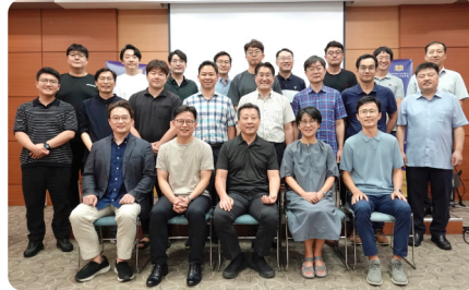
GCI Ministry Competency Program, second cohort in Seoul, Korea