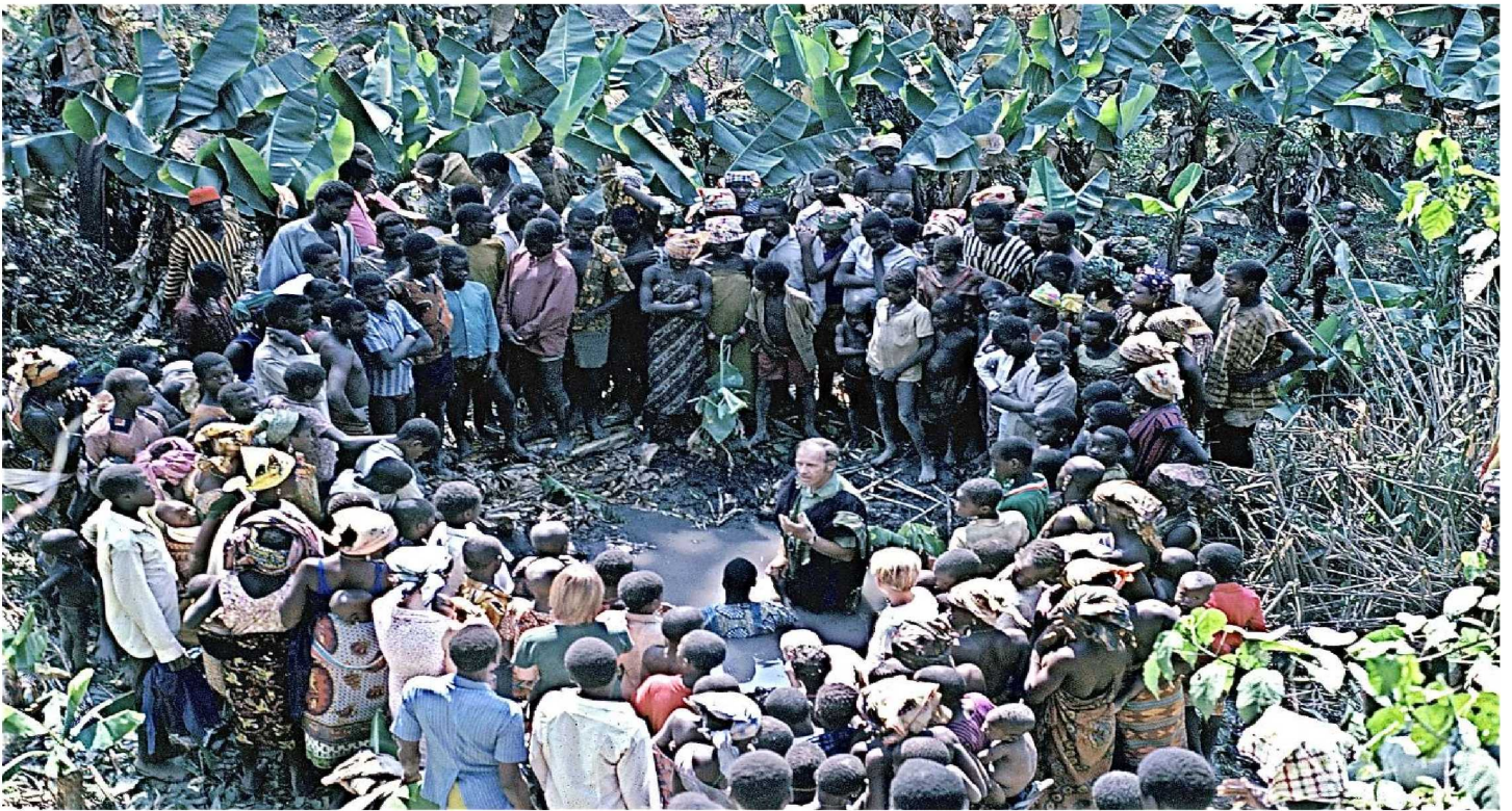
Baptism in a hole dug in a bed of a small stream